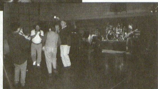
After the Homecoming football game, many alumni danced, visited with friends and enjoyed some great refreshments.